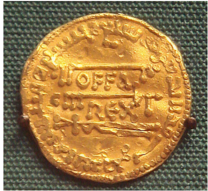
A mancus gold dinar of king Offa of Mercia.