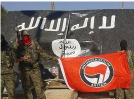
ISIS, with Antifa flag